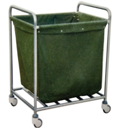
SSI 33 - Linen Trolley