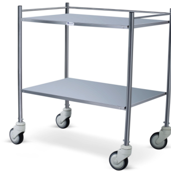
SSI 37 - Instrument Trolley