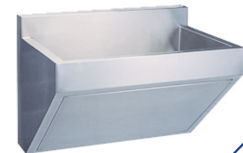
SSI 51 - Scrub (Sink for Operation Theatre)