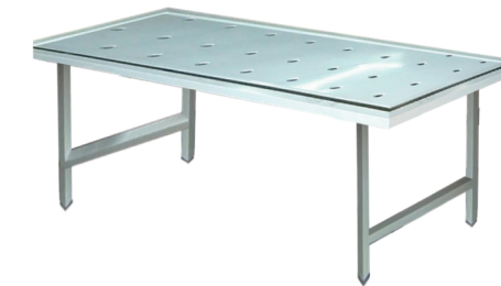
SSI 27 - Attendant Bed (Delux)