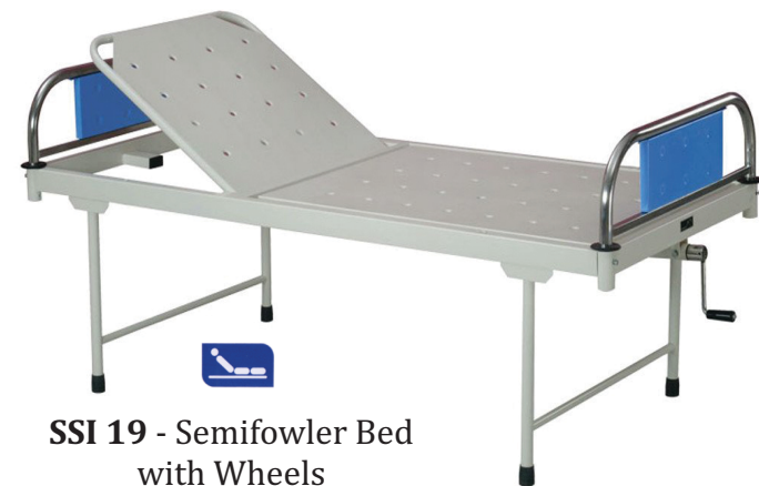
SSI 19 - Semifowler Bed with Wheels