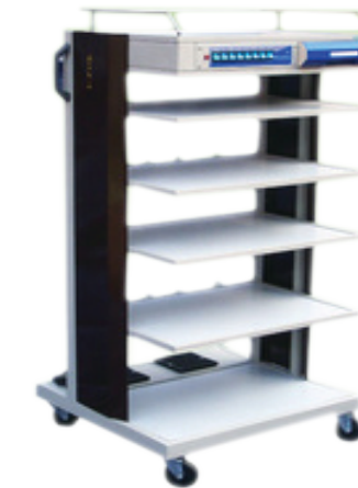
SSI 48 - Laparoscopic Trolley