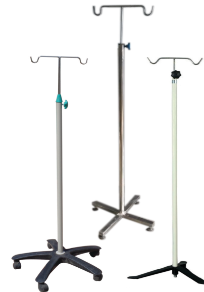
SSI 29, 30, 31 - Saline Stand (Five, Four & Three Winged Base)