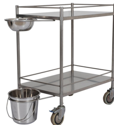
SSI 41 - Dressing Trolley