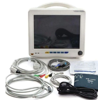
SSI 47 - 12".1 Multi Para Monitor