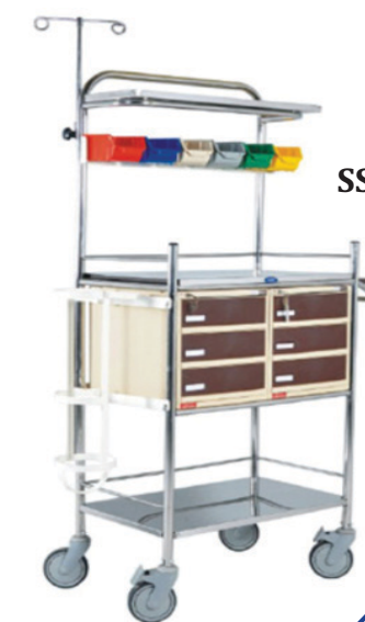
SSI 14 - Crash Cart