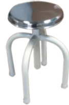
SSI 03 - Patient Revolving Stool