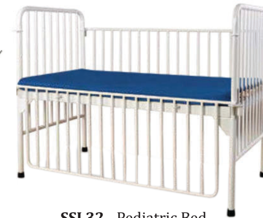
SSI 32 - Pediatric Bed with Side Ralings