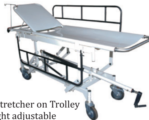
SSI 07 - Stretcher on Trolley height adjustable