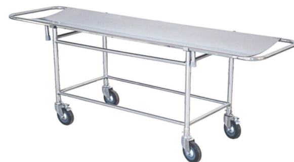
SSI 08 - Stretcher on Trolley