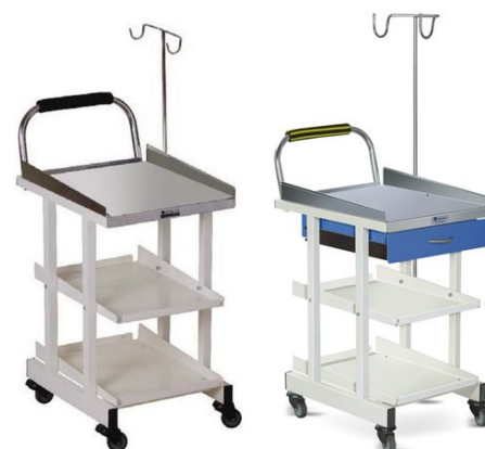
SSI 43 & 44 - ECG Machine Trolley