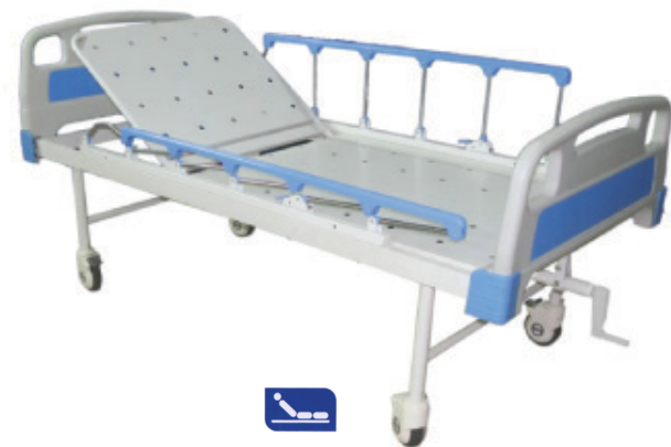
SSI 17 - Semi fowler Bed (With wheels and side Rails)