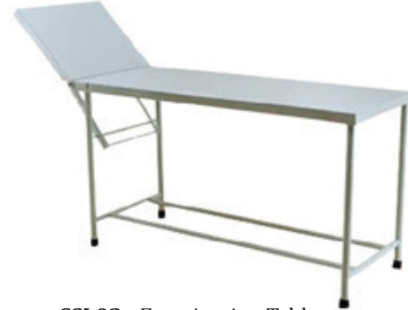
SSI 02 - Examination Table