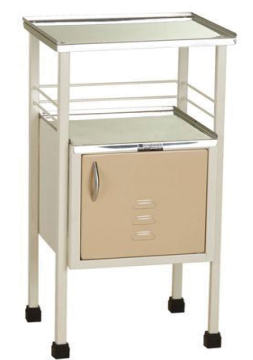
SSI 24 - Bedside General Lockers