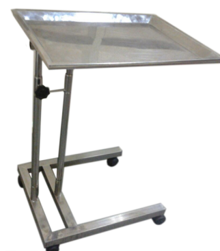
SSI 39 - Mayo Trolley Doble Bar SS