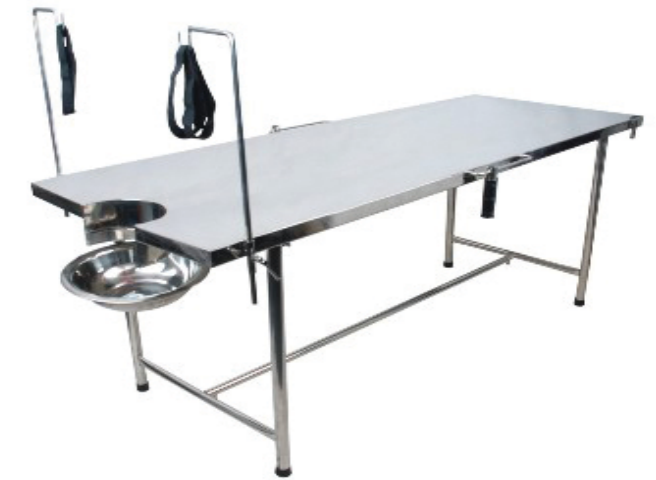
SSI 46 - Plain Labor Table