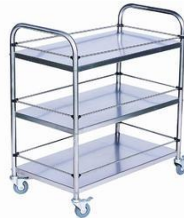
SSI 40 - Instrument Trolley (3 Racks)