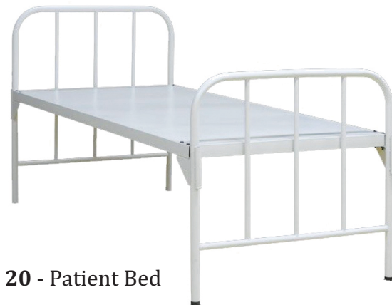
SSI 20 - Patient Bed