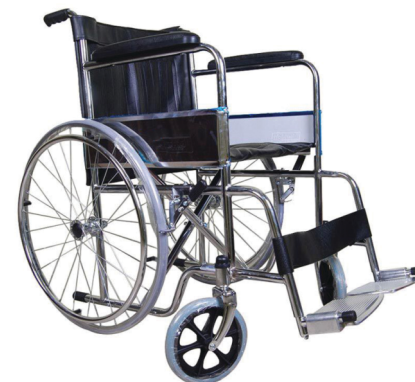
SSI 09 - Folding Wheel Chair