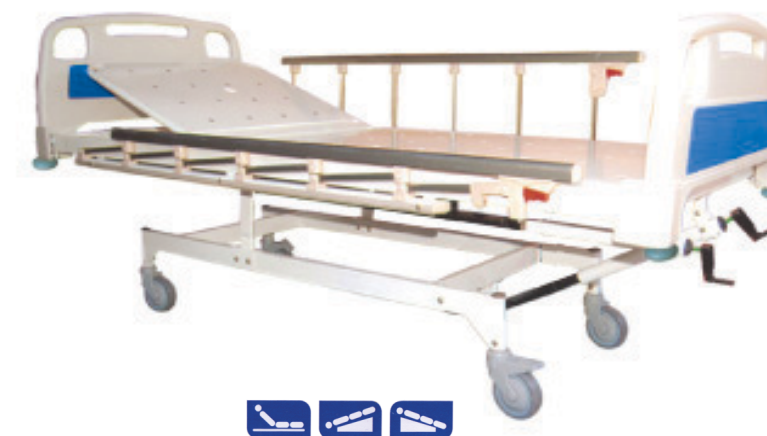
SSI 13 - ICU Fixed Height Semi fowler Bed