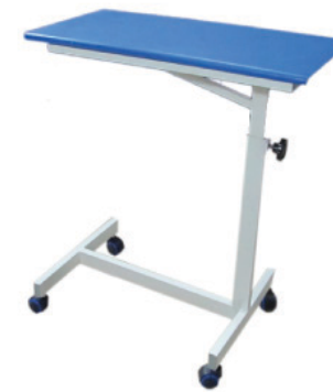
SSI 25 - Adjustable Over Bed Table