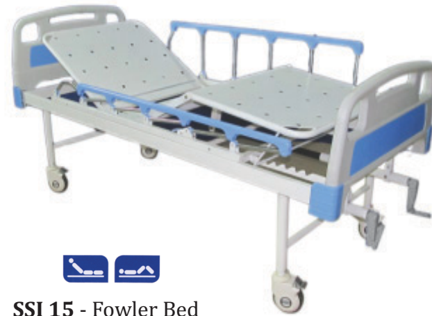
SSI 15 - Fowler Bed (With Wheels and Side Rails)