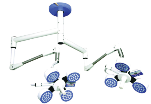
SSI 49 - OT LED Light