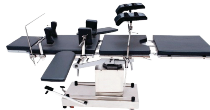
SSI 50 - OT Hydraulic Table