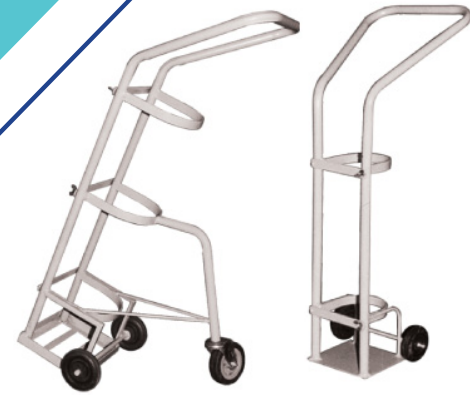
SSI 34&35 - Bulk Cylinder Trolley & Cylinder Trolley 'B' Type