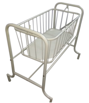
SSI 28 - Baby Cradle