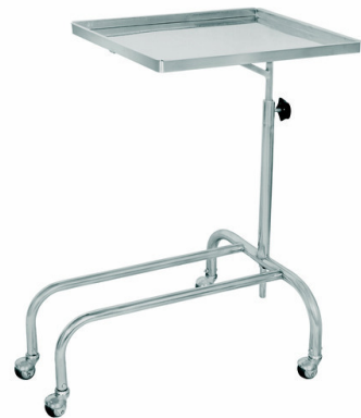
SSI 38 - Mayo Trolley Single Bar