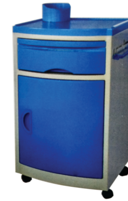
SSI 21 - Deluxe Bedside Lockers