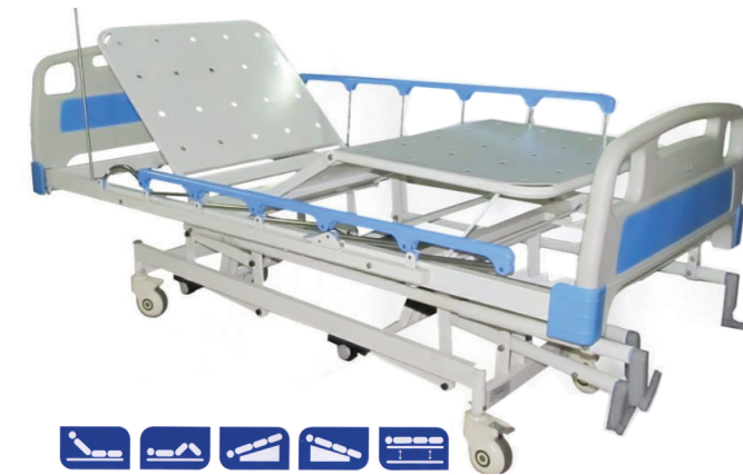
SSI 11 - Hi-Lo ICU Bed