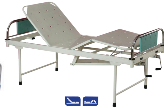
SSI 16 - Fowler Bed with Metal Board Panels