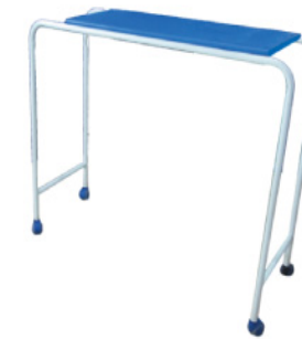
SSI 26 - Food Trolley