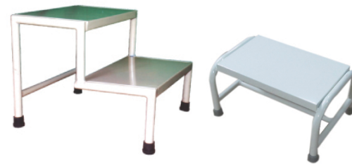
SSI 04 & 05 - Double & Single Foot Step