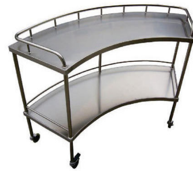
SSI 36 - Curved Trolley