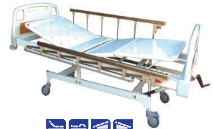
SSI 12 - ICU Bed Fixed Height