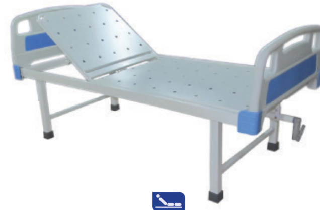
SSI 18 - Semi Fowler Bed (Polymer Moulded Head & Foot Pannels)