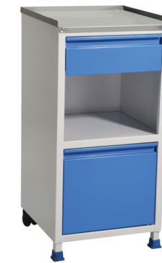
SSI 22 - Deluxe Bedside Lockers