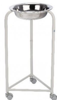
SSI 42 - Basin Stand Single