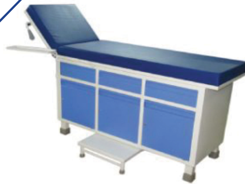
SSI 01- Examination Couch Deluxe