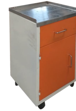
SSI 23 - Deluxe Bedside Lockers