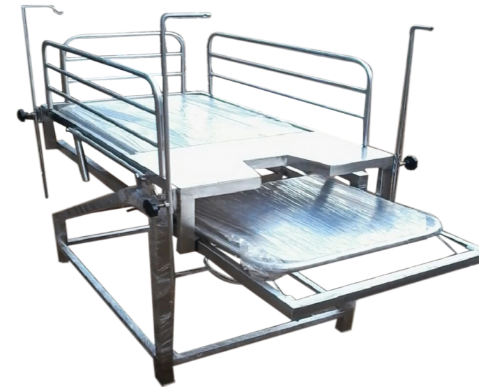
SSI 45 - Obstetric Labor Table SS